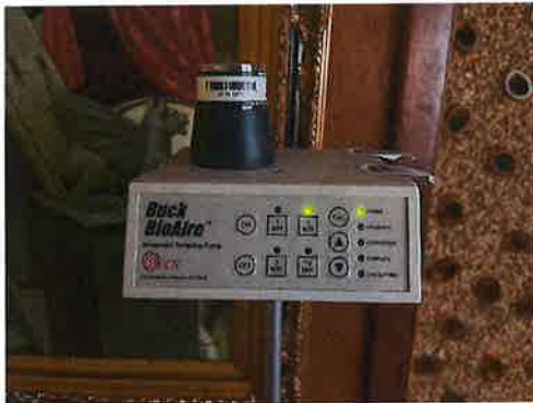
Interior Family Room sample