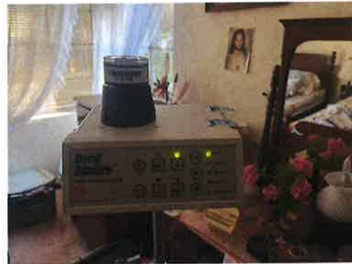
Interior Southwest Bedroom sample