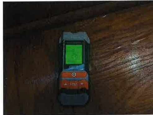
Interior Family Room East wood flooring Elevated moisture content (26%)