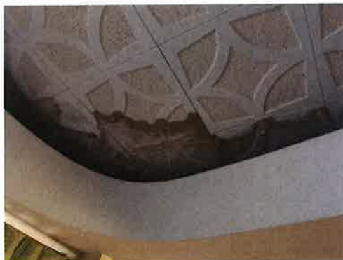
Interior Family Room East tile ceiling Visible water damage Visible microbial growth