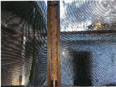
Interior Dining Room South window casing Visible microbial growth