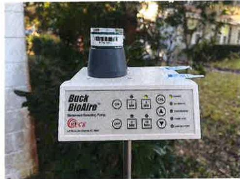
Exterior North wall baseline