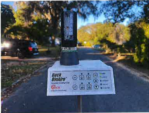
Calibration prior to testing