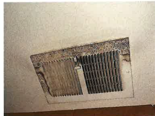
Interior Family Room East plaster ceiling, metal HVAC vent Visible water damage Visible microbial growth